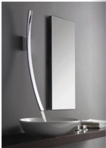
● Graff Italia

The use of wood, veneer along with stones for wall claddings, mirror