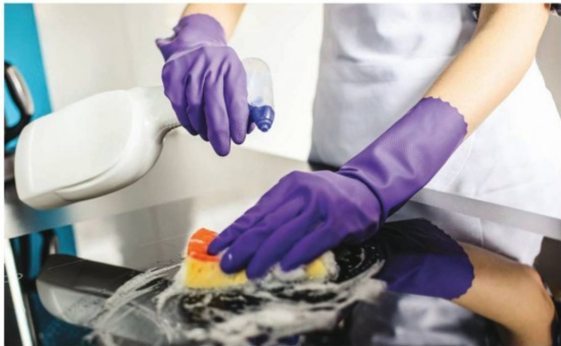
● Food safety and sanitation is an essential part of the food industry.

"Overall, it is a process that includes many steps right from receiving, preparation, production, dish-washing, pot washing and garbage areas to maintaining the cleanliness of the floors, wall tiles, exhaust system and hood. Pest control on regular intervals must done in and around